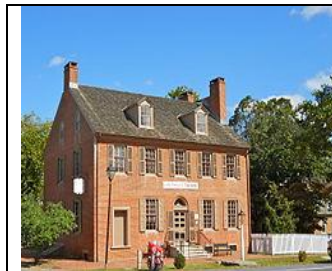
Cantwell’s Tavern, Odessa

lunch or supper, to cap off your visit back to early American history.